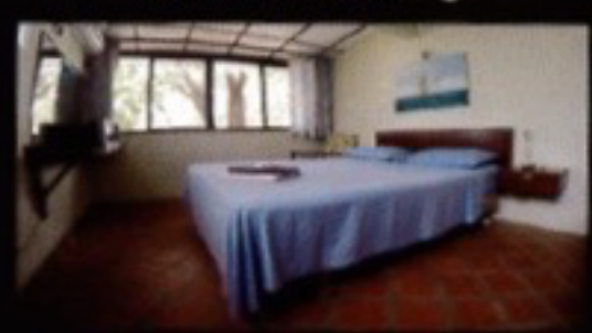
Clean, Comfortable Rooms